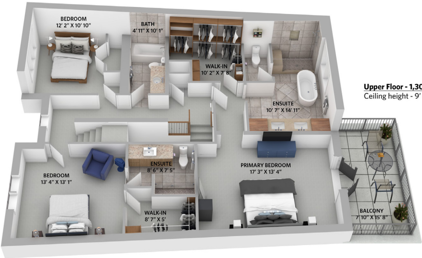
Upper Floor - 1,308 sq.ft. Ceiling height - 9' 0" to 9' 10"

Garage: 647 sq.ft. Exterior Living: 913 sq.ft. Garden Areas: 250 sq.ft.