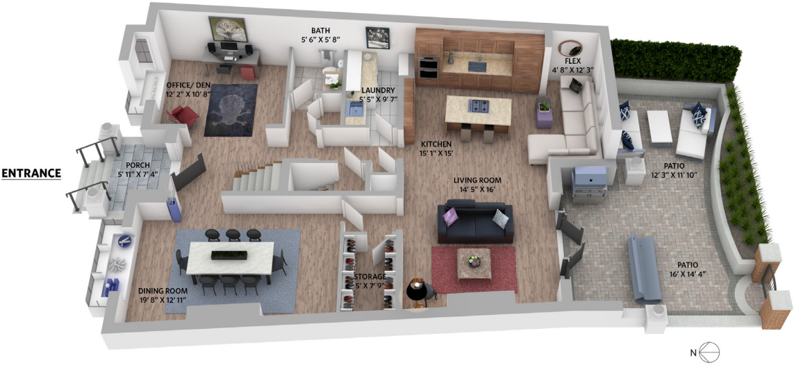
Main Floor - 1,386 sq.ft. Ceiling height - 10' 3" to 11' 2"